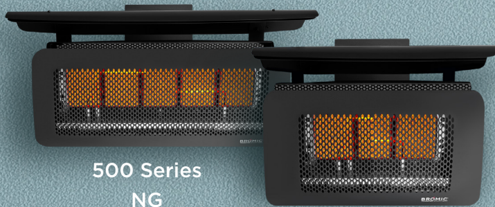
500 Series NG